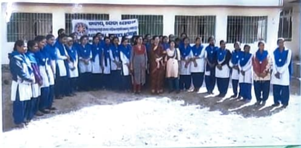
N.S.S. Volunteers with Prinupal + N.S.S. Programme officers